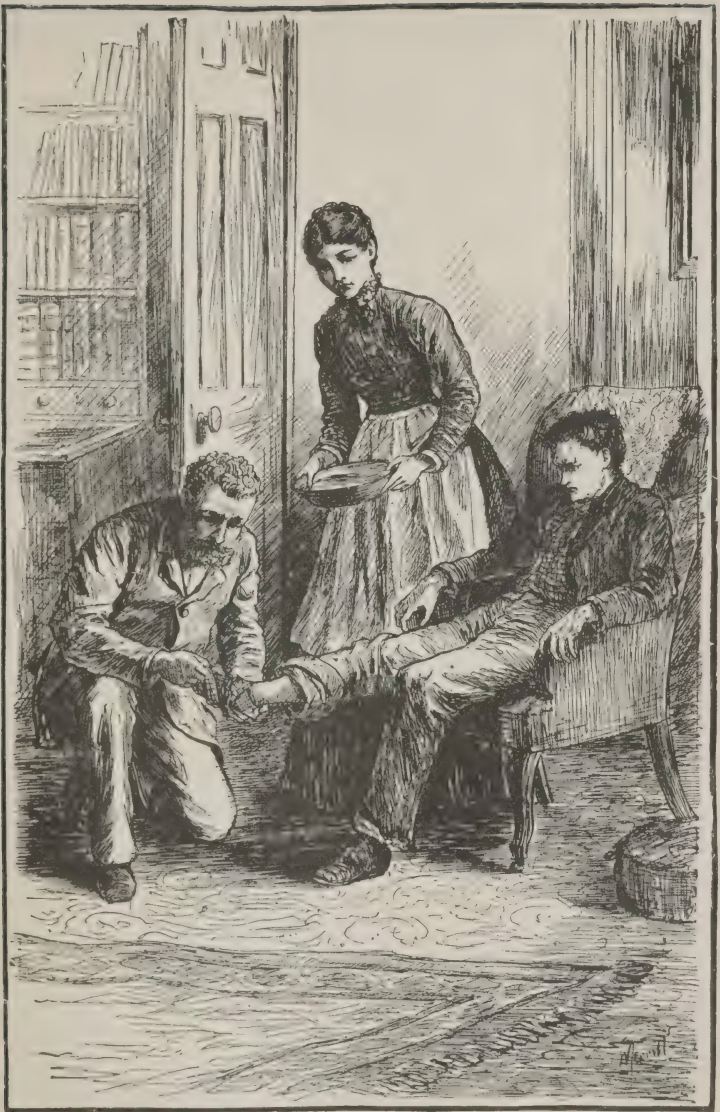
Mr Bhaer bathed and bound up the wounded foot, while Mrs. Jo prepared the only empty bed in the house." — PAGE 162.